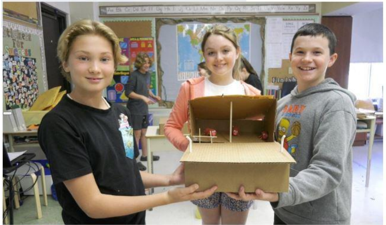
Grades 5 and 6 students at St. Theresa Catholic Elementary School were building their structures Thursday morning.

The NBSA " The Climate Change Challenge: The Three Little Climate Pigs vs. the Three Big Climate Change Impacts " (or Kid Kits ), was launched this year to Grade 6 students as an educational activity for elementary school students. Extensive planning went into the 2023 pilot project, which involved collaboration with two of the four local school boards, namely the Nipissing Parry Sound Catholic School Board (NPSCDSB) and the Near North District School Board (NND SB). The 2023 Kid Kits pilot project received positive feedback and was deemed successful for its inaugural year.